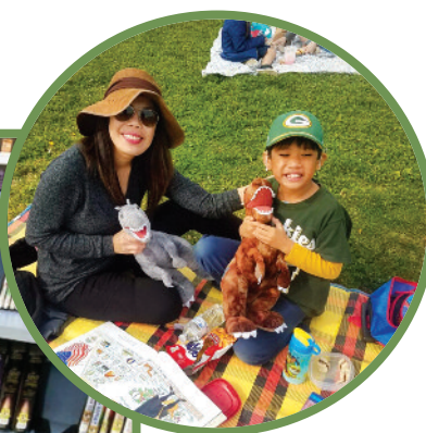
Left, above, and below: Families enjoy a Dr. Seuss Read-A-Thon and family picnic.