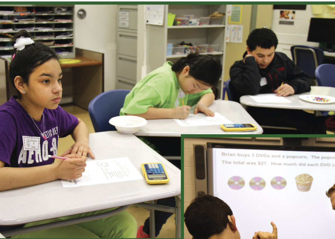
Above and right: Keeping expectations high and working with students on more complex concepts helps them to excel (e.g., math word problems).